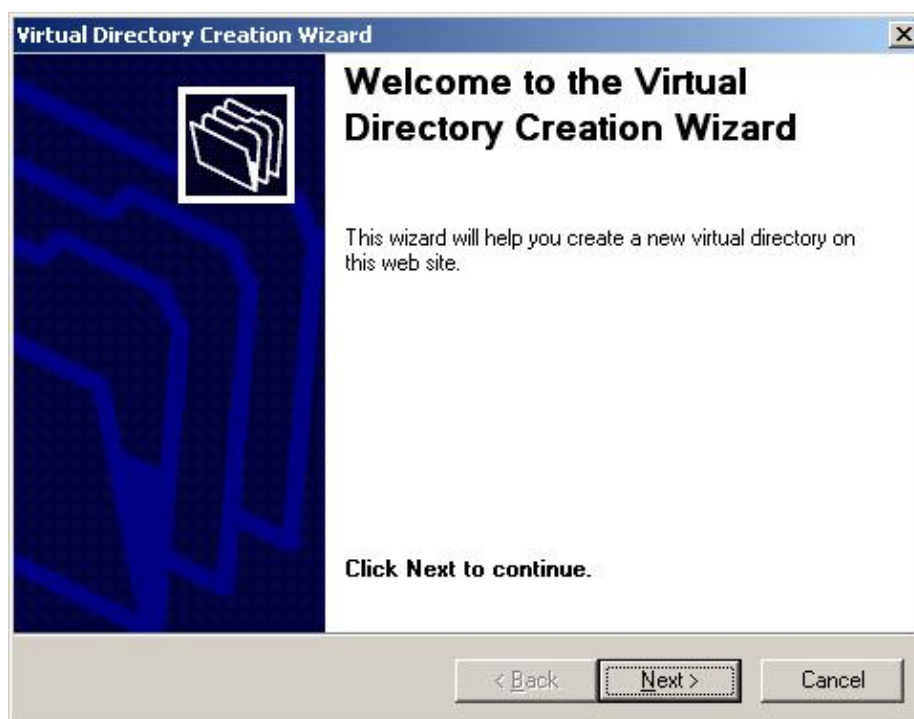
Figure 5-4: The Virtual Directory Creation Wizard Window