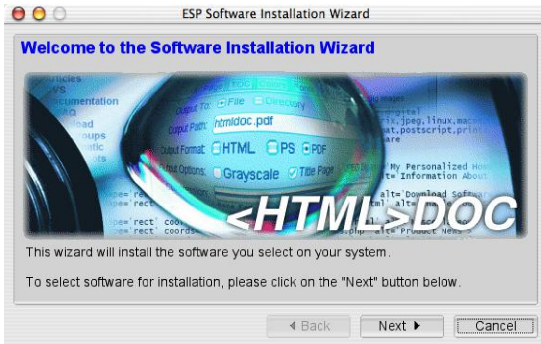
Figure 1-2: The software installation wizard

Double-click on the Install icon in the Finder window to start the software installation wizard (Figure 1-2) and follow the installer prompts.